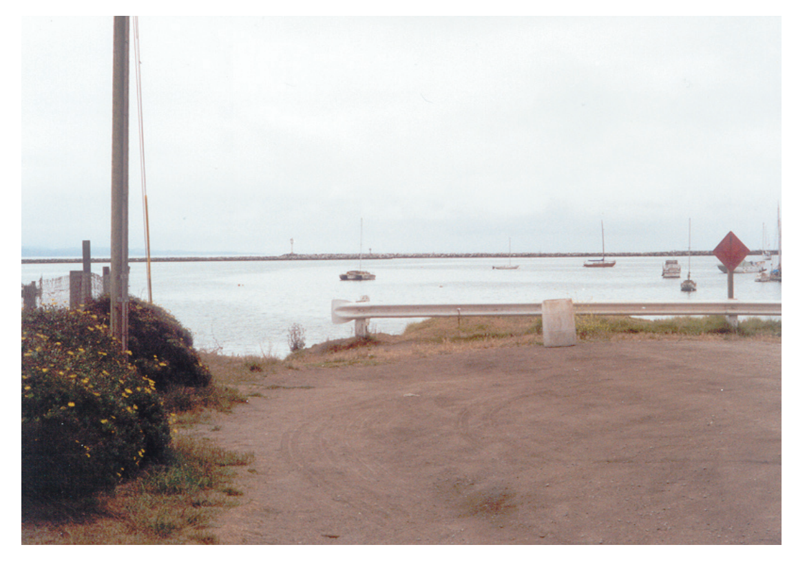
Coastal Access Improvement Plan/Five Coastal Sites Callander Associates Landscape Architecture, Inc.